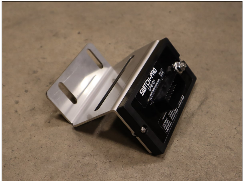
Attach the SwitchPro Relay to the bracket. (Step 2)

3 Attach the bracket to the inner fender. Route and connect the wiring as desired.