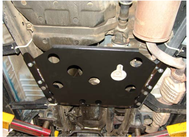
Installation complete (Step 5)

Hint; The holes in Slee Belly Plate Skid will allow the user to drain and fill the transfer case without removal of the Skid Plate. The holes will also make it easier to remove mud, snow, etc.