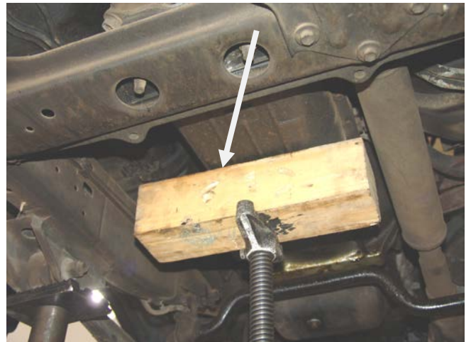
Supporting the transmission (Step 2)