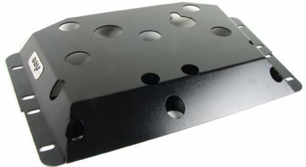
Prepare for the installation (Step 1)

Note; Installation could be performed without a lift or jack(s) if proper safety precautions are executed.