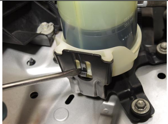
Un-clip reservoir front bracket ( Step 3A )

Separate reservoir from bracket and remove bracket by removing three bolts as shown. Discard bracket and three bolts.