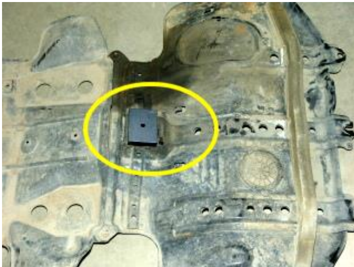
Location of the 75mm square spacer

Torque all the bolts to specification as listed.