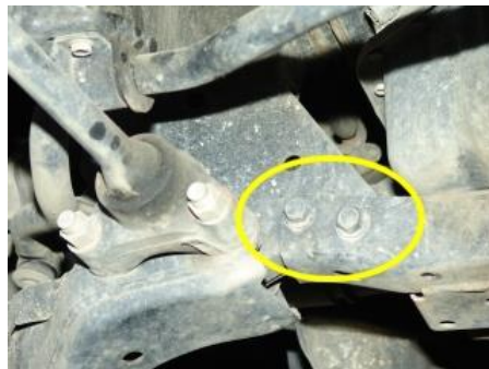
Side bolts of the existing cross member