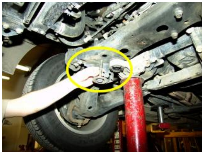
Latch hook with bolts and split washers.