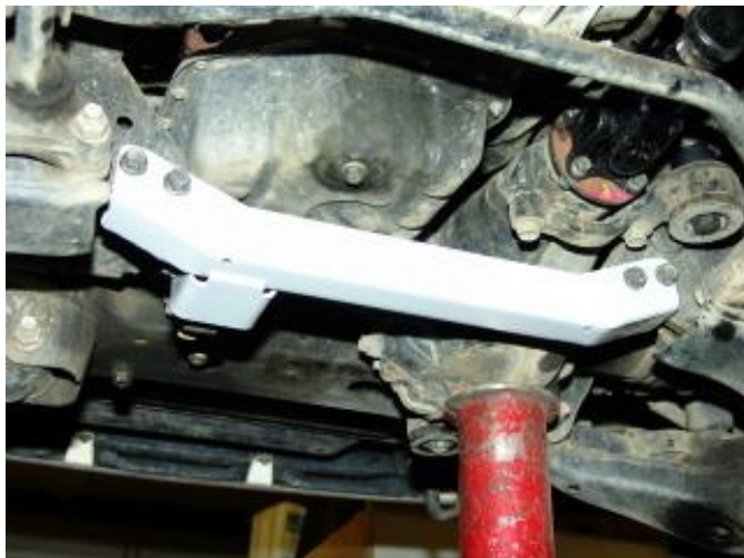
New Cross Member Installed