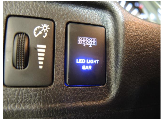
Switch operation verified with illumination ( step 4A )

If the switch is engaged and illumination is on the switch should light up as shown in Step 4B.