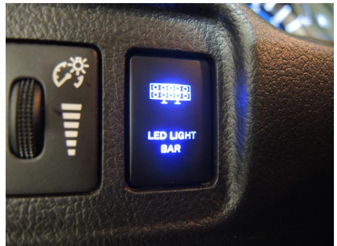
Switch engaged and illumination on ( step 4B )