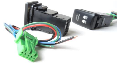
Wiring instructions ( Step 3 )

4. Verify all connections and test switch.