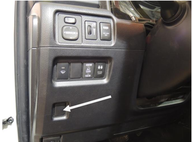
2010+ 4Runner location shown that isn't compatible ( Step 1 )

Known Compatibility Issue; 2010-Current 4Runner - the switch you purchased isn't compatible in this location (as shown).