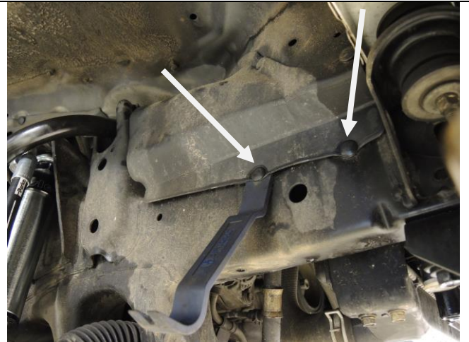
Driver reservoir location ( Step 4 )