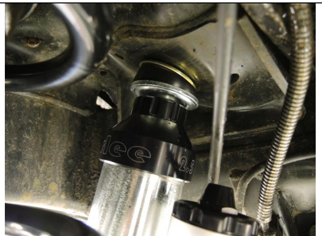
Rear shock bushing and washer ( step 5A )

Disclaimer; if shock reservoir is orientated incorrectly it will contact frame, damage shock and void shock warranty.