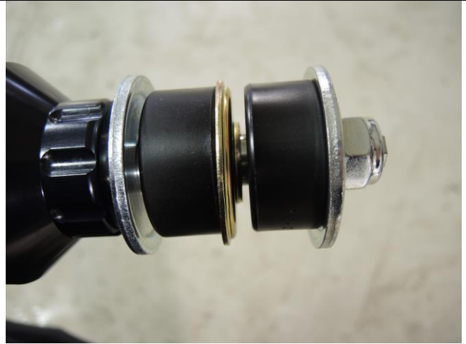
Bushing and washer orientation ( Step 2 )