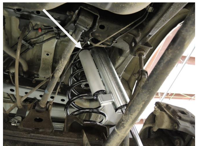
Reservoir must be mounted as indicated ( step 5B )