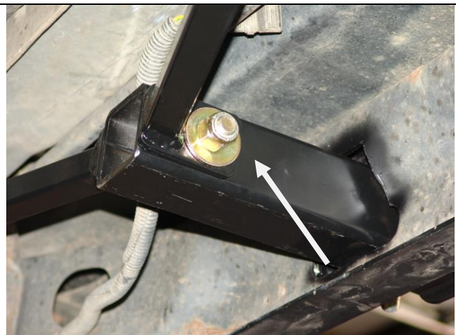
Install the legs ( step 5A )

Note; the bolt heads are installed in the inside of the receiver (photo 5A).