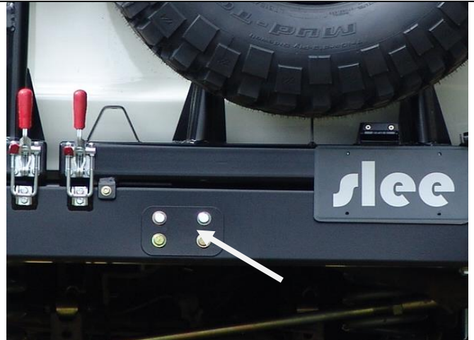
Mark cross member & bolt location (Step 2)

Mark the cross member and bolt hole locations through the Slee Rear Bumper (photo 2) to be cut and drilled.