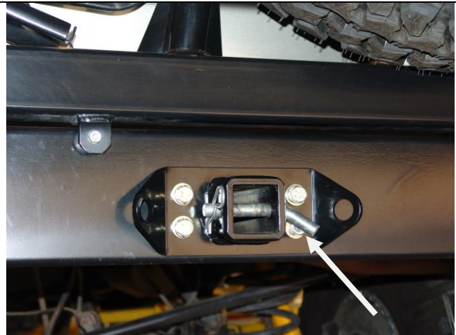
Install the receiver ( step 4 )

Note; the nut plates are installed inside of the cross member.