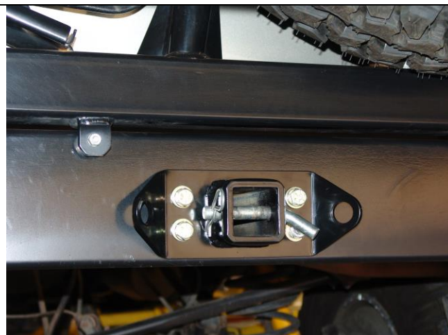
Installation complete ( Step 6 )

Thank you for your purchase from Slee Off-Road! Visit us at sleeoffroad.com or email us at sales@sleeoffroad.com . Follow us on Facebook and Instagram!