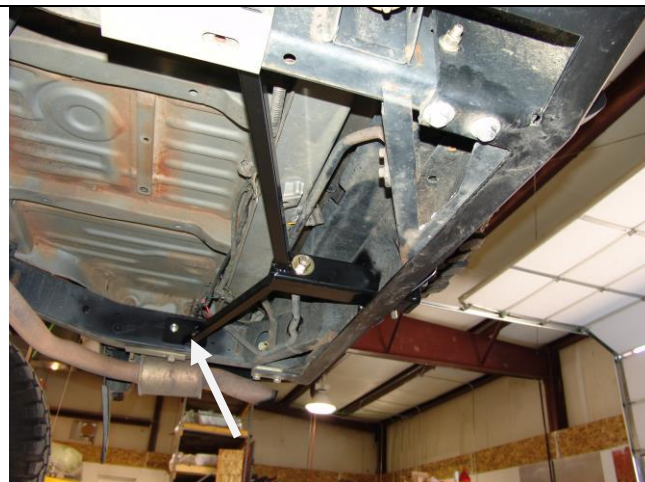
Install metric hardware on frame side ( Step 5B )