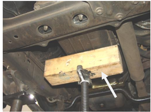
Supporting the transmission ( Step 2 )