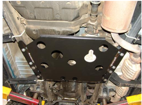
Installation complete (Step 5)

Hint; The holes in Slee Belly Plate Skid will allow the user to drain and fill the transfer case without removal of the Skid Plate. The holes will also make it easier to remove mud, snow, and etc.