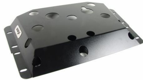
Prepare for the installation ( Step 1 )

Note; Installation could be performed without a lift or jack(s) if proper safety precautions are executed.