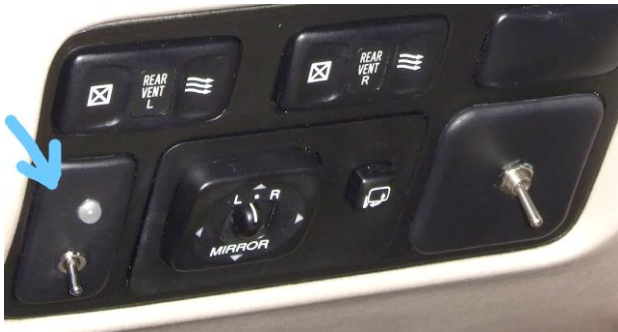
Slee AHC Override Switch installed in an OE Switch Blank