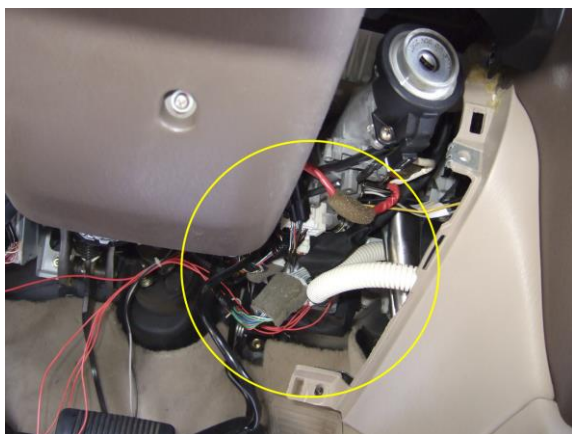
Location of AHC Unit