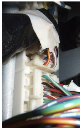
Plugs on AHC Unit