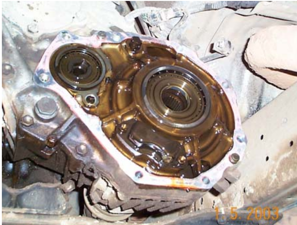
The photo below shows the viscous coupling removed from the extension housing.