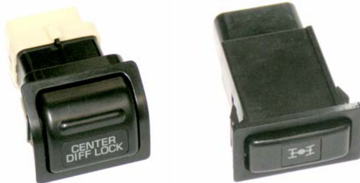
Early and Late Model Center Diff Lock Switches

3. This product requires the vehicle to be fitted with a Center Diff Lock Switch. If yours are not fitted with one, please contact Slee Off-Road to purchase the correct switch