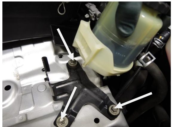
Remove reservoir and bracket (Step 3B)