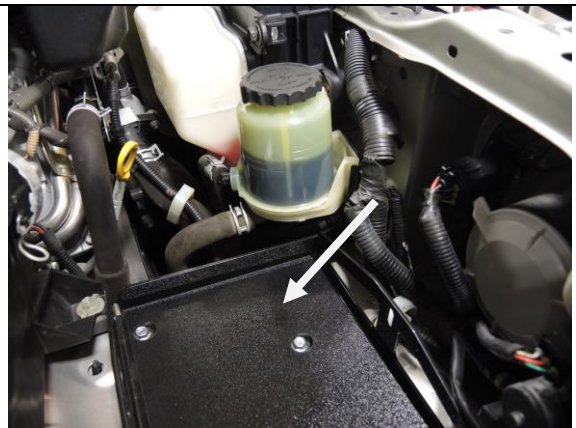
ABS riser installed (Step 6)