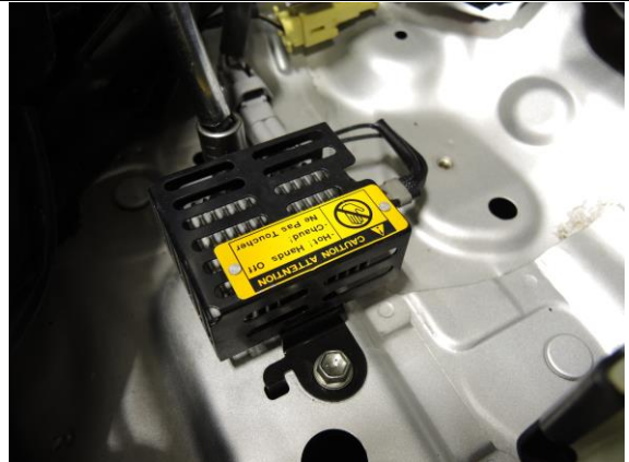
Remove bolts and unplug harness ( Step 2A )