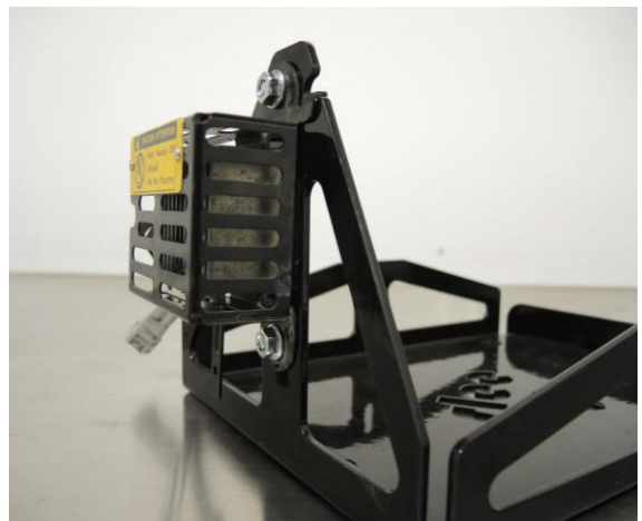
Mount DRL resistor to Slee tray ( Step 2C )