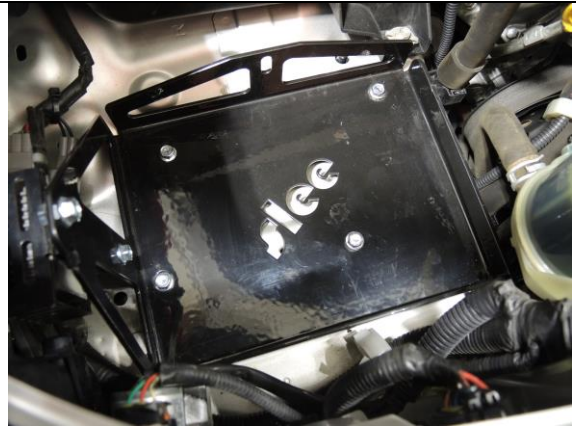
Mount tray (Step 5)