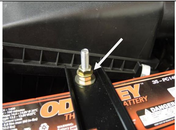
Detail of hardware orientation (Step 7)

1 x Slee Battery Tie Down 2 x J-Bolts 4 x SAE Nuts 2 x USS Washer 2 x SAE Washer