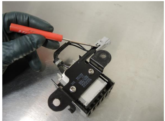
Remove connector from bracket ( Step 2B )