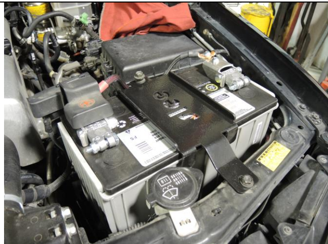
Installation complete ( Step 8 )

Disclaimer; The Slee Off Road Battery tray is designed to fit an Interstate 31P-AGM7. If another battery type or size is installed, validate the battery posts will not touch the hood once closed.