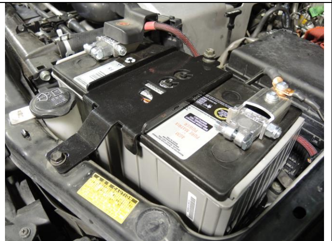
Install battery and tie down bracket (Step 6)

Note; recommend battery Interstate 31P-AGM7