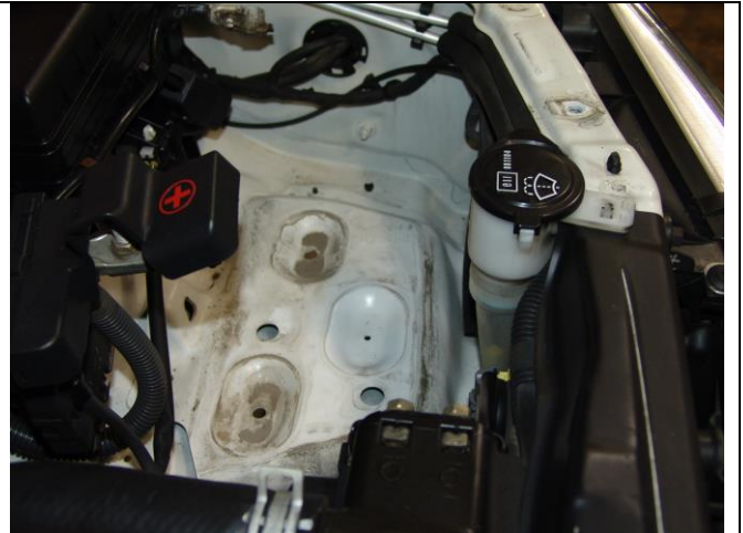
Remove Battery (Step 1)

Note; installation was performed on a 2004 Toyota Land Cruiser. Recommend battery Interstate 31P-AGM7.