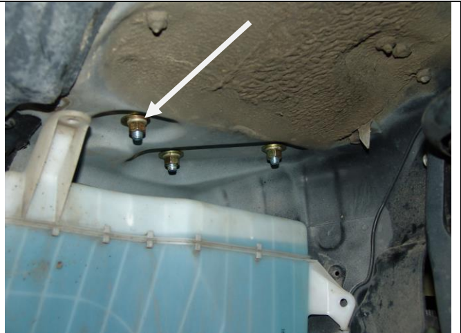
Note washer locations (Step 4C)