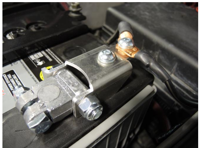
Negative shown ( Step 7B )