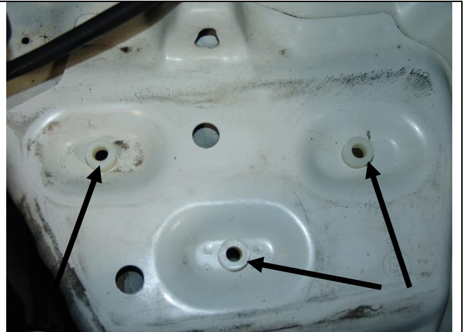
Drill and install spacers ( Step 3B )