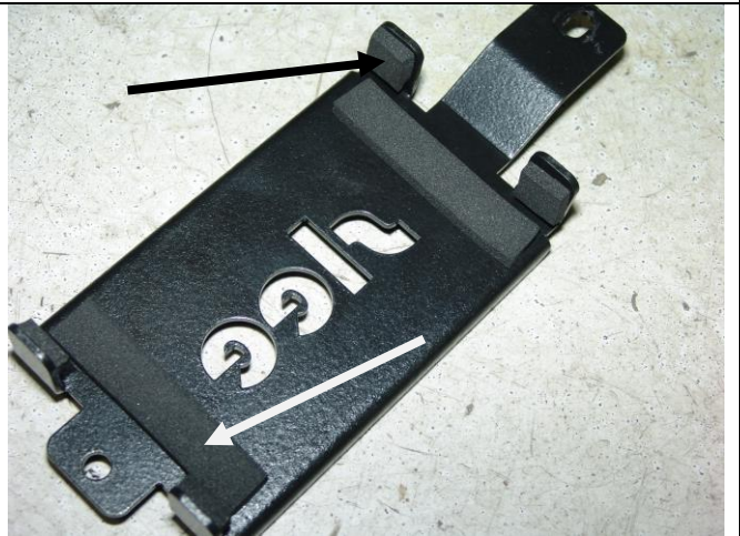
Install adhesive pads (Step 5)