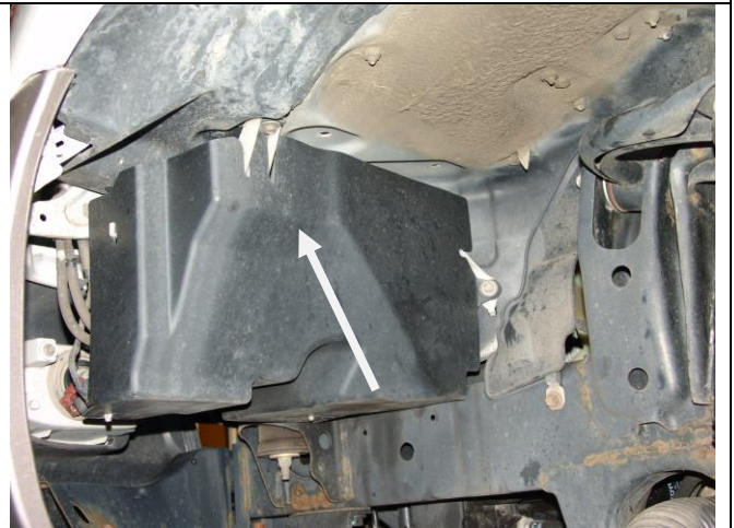
Remove hardware on reservoir (Step 2)