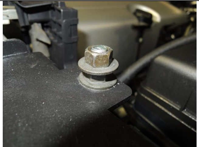
Double Nut on J-Bolt ( Step 6B )