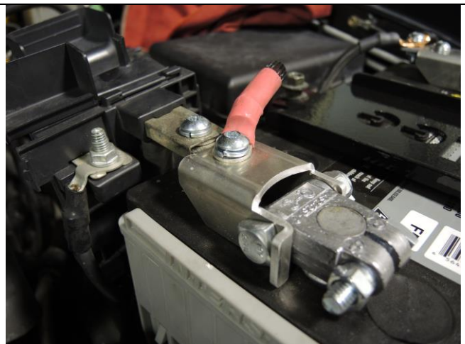
Positive shown ( Step 7A )